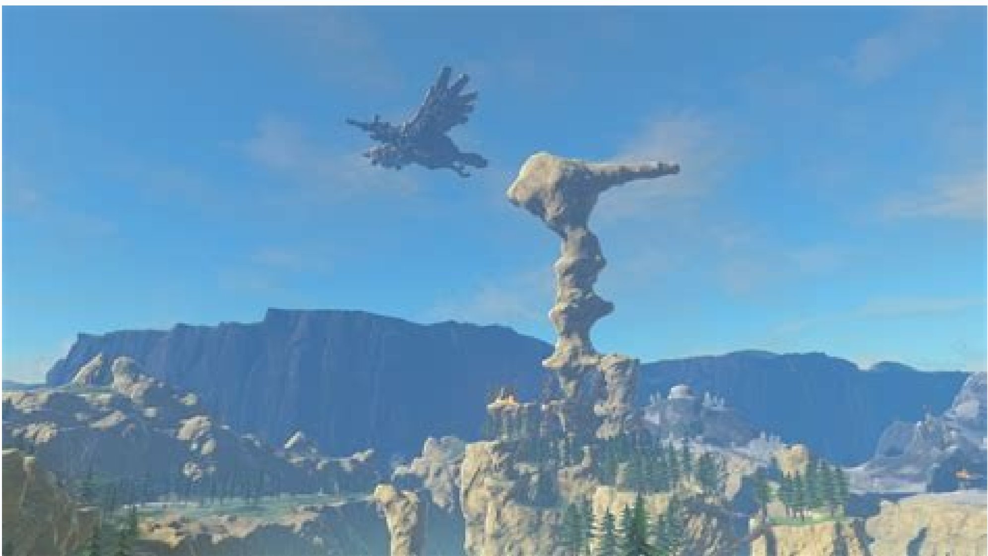
Should i activate divine beast vah ruta. How to complete vah ruta in breath of the wild. Breath of the wild how to get back on vah ruta. Breath of wild ruta guide. Zelda breath of the wild guide divine beast vah ruta. Zelda breath of the wild vah ruta guide. How to do vah ruta botw.